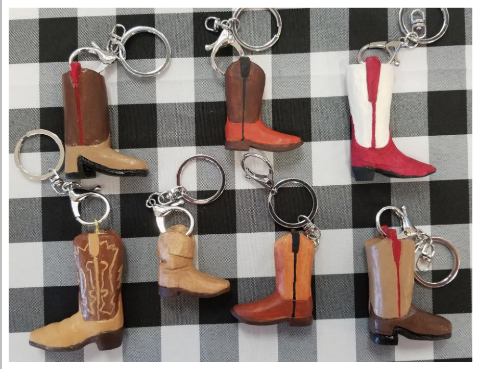
Member Donated Boot Carvings

Thank you to all who contributed to the "Call for Boots" for the Center 50+ Boot, Scoot and Brew event. By all accounts everyone who attended had a good time. Member-donated carvings were greatly appreciated.