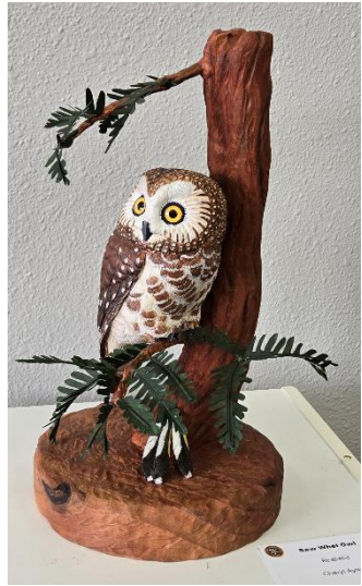
"Saw-Whet Owl" Cheryl Ayres