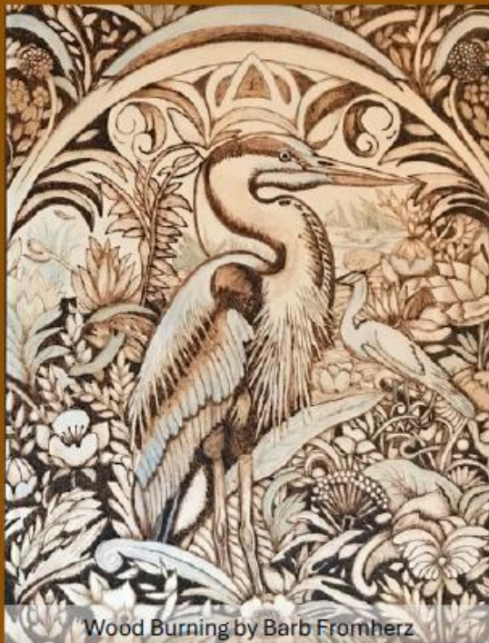
Wood Burning by Barb Fromherz