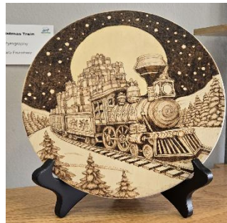
"Christmas Train" Barb Fromherz