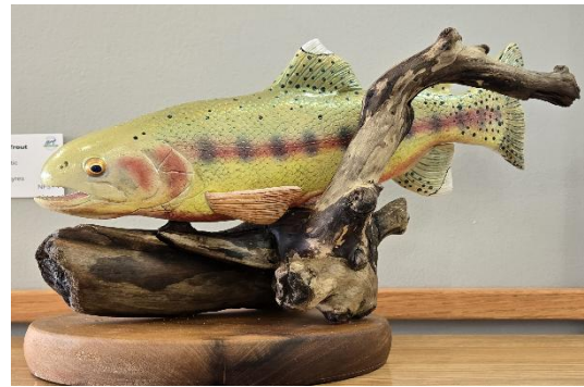
"Golden Trout" Cheryl Ayres