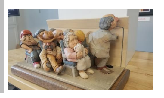
"Prepare for Departure" by Terry Moss Caricature Carving First Place