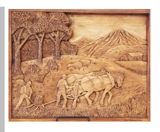
"Pulling Stumps" by Tim Flora Relief Carving First Place