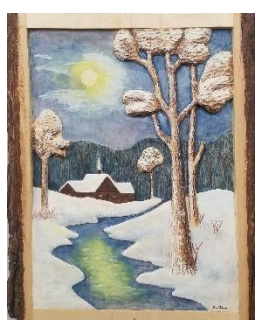
Early Winter by Tim Flora 2<sup>nd</sup> Place Winner