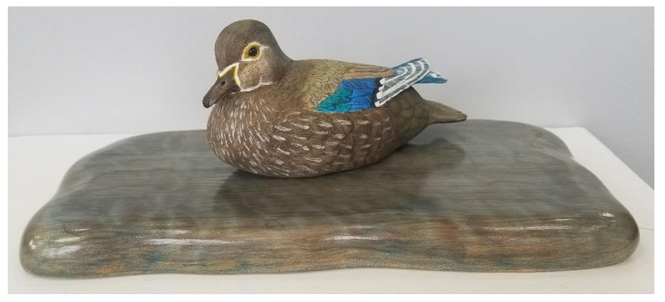
Wood Duck by Don Fromherz 1<sup>st</sup> Place Winner

What a great showing by our Capitol Woodcarvers members who were all recognized at the show reception. Traditional fine-art artists were amazed by the quality and variety of our members' entries.