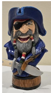
Pirate by Laurie Ladd