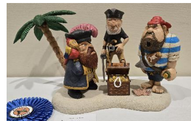
The Island by Angie Bell