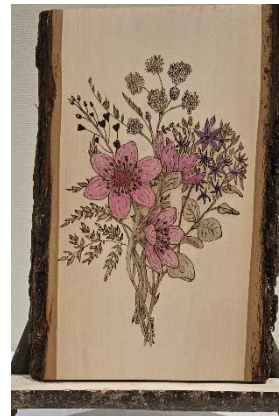
Summer Happiness by Donna Cereghino

Congratulations to all participants. These carvings are outstanding examples of what our talented carvers can create using simple tools and a piece of wood.