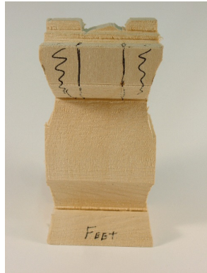
Bear 2 Front view of block