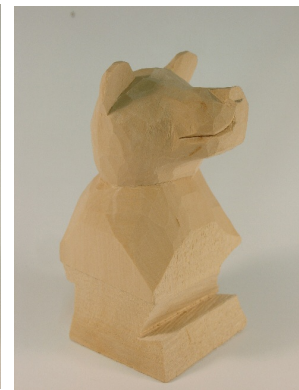
Bear 11 Mouth and nose outlined