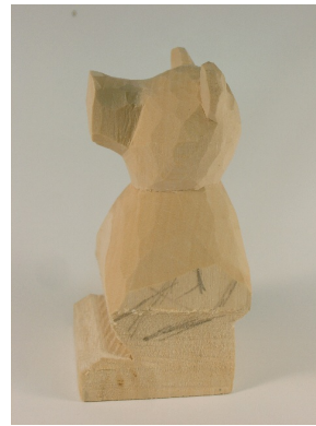
Bear 10 Side view of arm started and body rounded