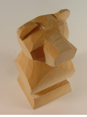
Bear 20 To view of snout started