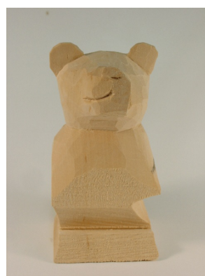
Bear 13 Arm started and mouth shown