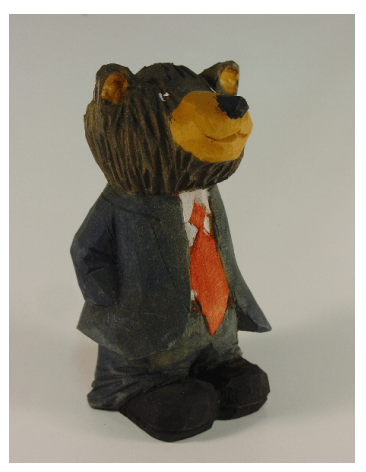
Well Dressed Bear