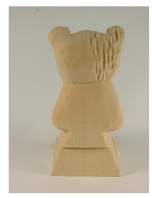
Bear 16 Back of head textured with small ugouge (1/8" or less)