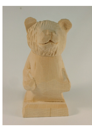
Bear 14 Completed arms and textured head