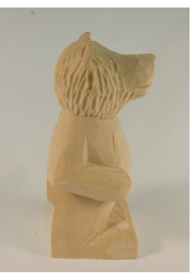
Bear 17 Finish texturing and round feet/shoes