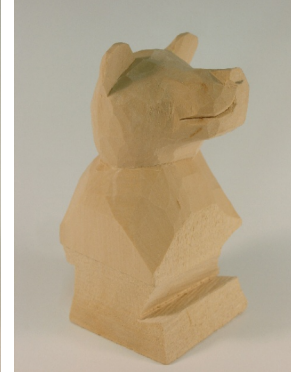
Bear 11 Mouth and nose outlined