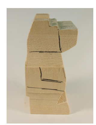
Bear 1 Side view of block