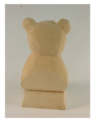
Bear 8 Back view of head with neck outlined