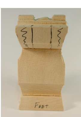
Bear 2 Front view of block