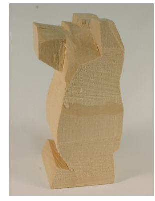
Bear 5 Side view of snout and ear started Make sure snout is very defined