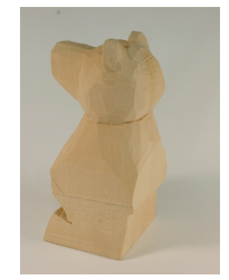
Bear 7 Show back of head outlined and snout/ears defined