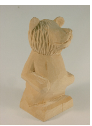
Bear 18 Do not texture the snout.