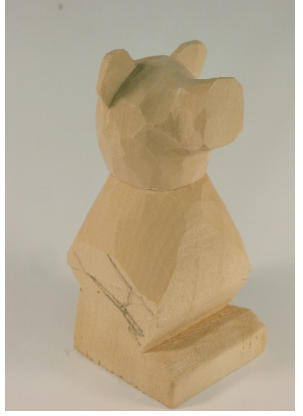
Bear 9 Start on arms and rounding body