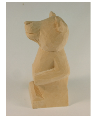
Bear 15 Side view of finished arm and head