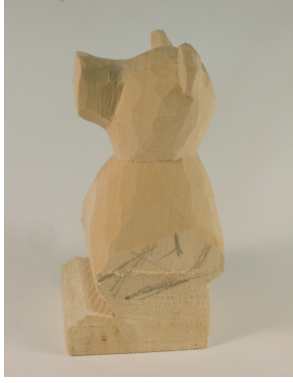
Bear 10 Side view of arm started and body rounded