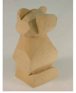
Bear 6 Show snout and ears defined as well as neck outlined