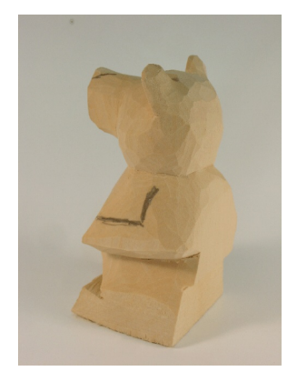
Bear 12 Dig out bottom of arm