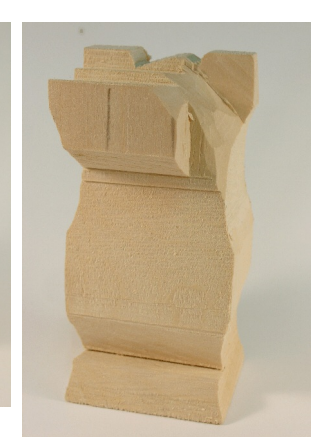
Bear 4 Start with getting snout carved and ear started